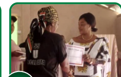
ISSUING OF CERTIFICATES II